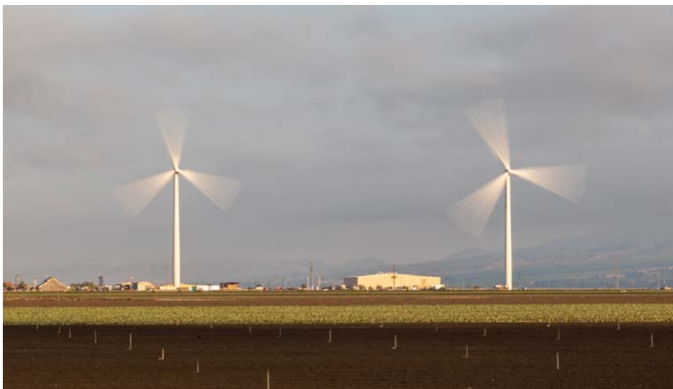
Power Windmills Dick Light