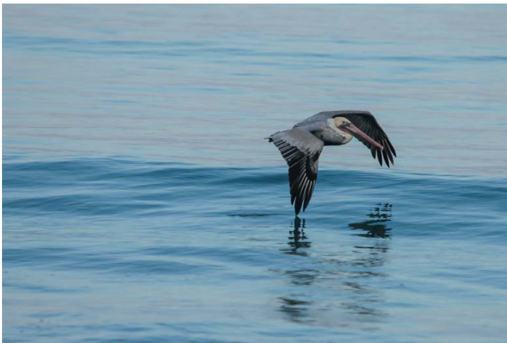
Pelican on Migration